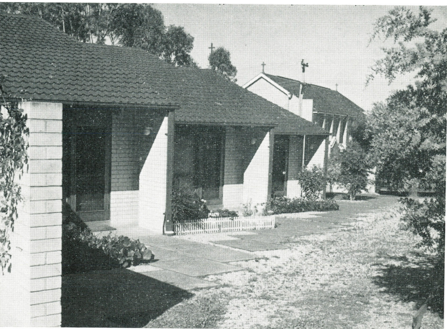
s for ambulatory residents conducted by Catholic Housing Guild for the Elderly at Brenbeal Street, Balwyn.

The Council is most appreciative of the help given by municipal councils in supplying names and addresses of rest homes either registered with the local council, or known to the council.