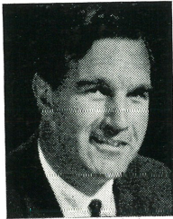
Hon. Ian Sinclair M.P.