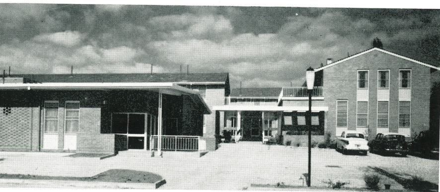
East Home for Aged People, Gascoyne Street, Canterbury, provides accommodation in self- catering rooms with meals, and single rooms with meals, together with an associated hospital.