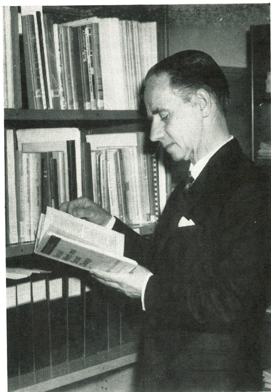
A City Councillor browsing in Council Library.

Employ Material A Offer of Help Recreation