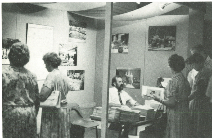
Retirement Villages Association stand at VCOTA's Senior Citizens' Week Expo.

Apologies are extended to members who have forwarded articles, letters, or items of interest for inclusion. Again this will be rectified with assistance in this area.