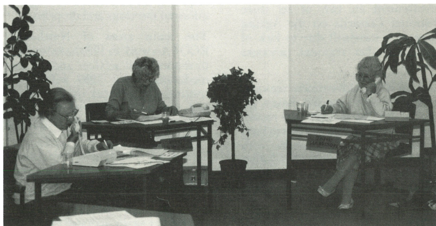
CAB Volunteers at work during the Hotline.